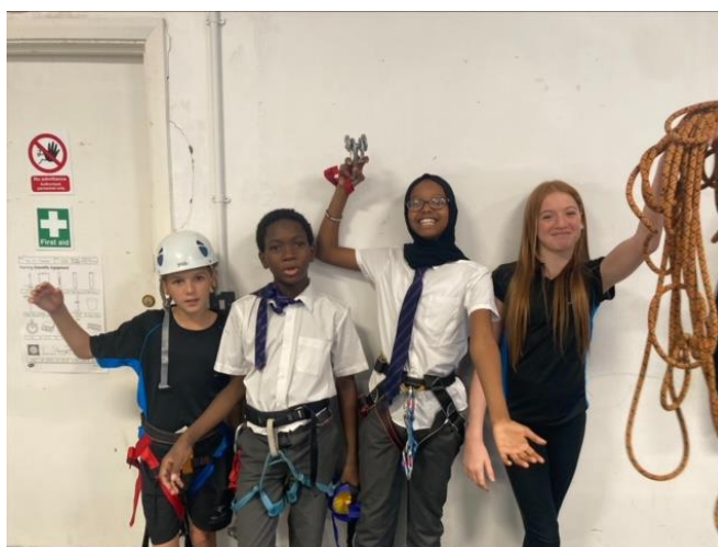
Pupils learning the ropes at Boulders

Enrichment is many things that the pupils can choose to do beyond their academic pursuits and the normal requirements of their life in school. Developing their social, moral, spiritual and cultural strengths will allow them to succeed in education, work and society.