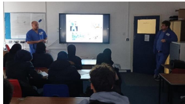
NHS Seminar for Willows pupils

On Wednesday we had the first in a series of employer visits who will be delivering talks to Year 11 pupils about their industry and professions. This week's visitors were from the Cardiff & Vale University Health Board Perioperative Team. Their main topic of delivery concerned the different roles that exist in an operating theatre and the pathways into that profession. There was a lot of interest in the talk, with a class full of pupils all choosing to attend and asking questions regarding the subject.